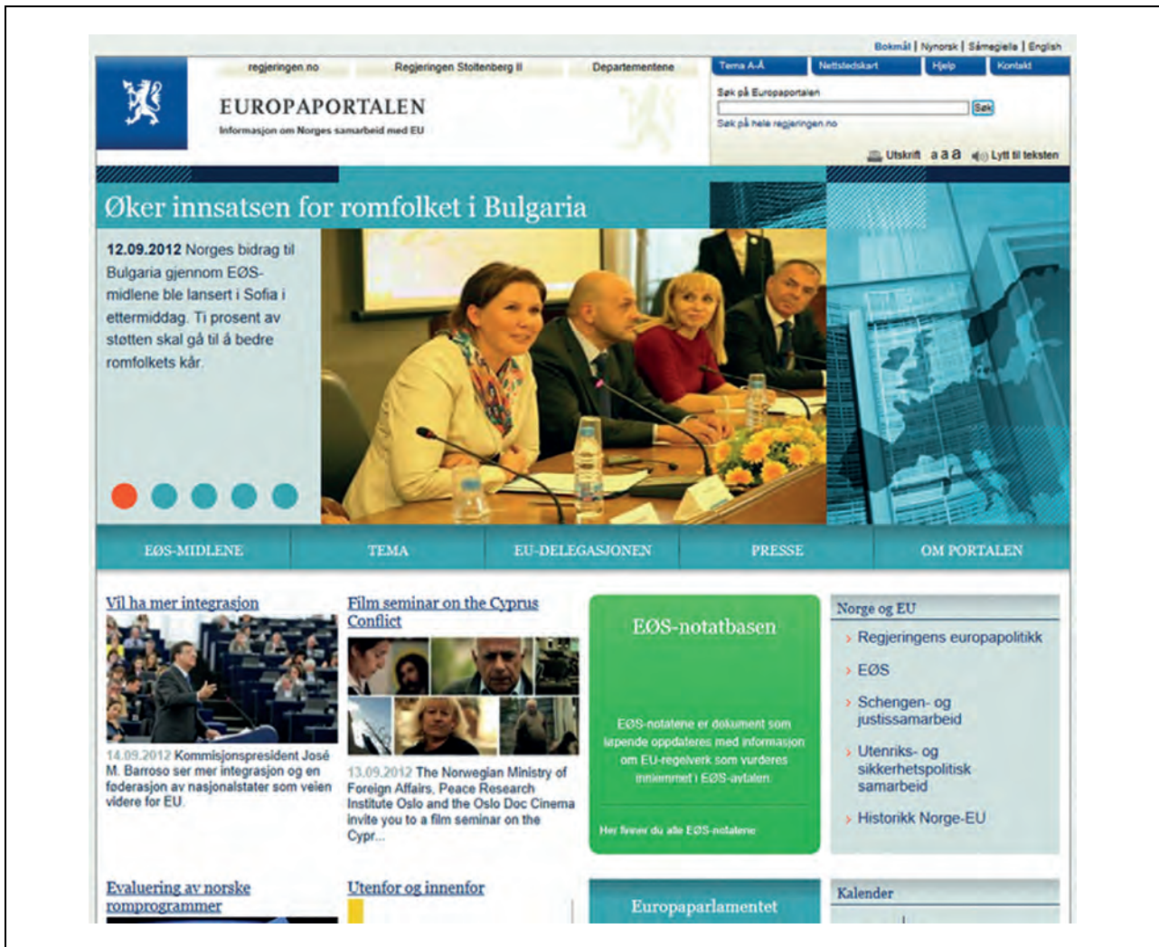
Figure 4.1 An upgraded European portal was launched in summer 2012. The new portal is a comprehensive source of information on Norway's cooperation with the EU.

ried out by the Sentio Research Group in May 2011 in connection with the preparation of Official Norwegian Report NOU 2012:2 Outside and Inside: Norway's agreements with the European Union , young people in particular reported that their knowledge of these areas was poor. Both the official report itself and a large number of comments received in connection with its preparation indicate a need to increase efforts to enhance young people's knowledge of Norway's agreements with the EU. Knowledge of the EU/EEA is one of the subject areas included in the current national curriculum for social studies and in the learning objectives set for years 7, 10 and the first year of upper secondary school. The Government will support the work carried out by schools to ensure that these learning objectives are achieved. It is important for young people to have access to up-to-date and neutral information. The Government will therefore facilitate the develop-