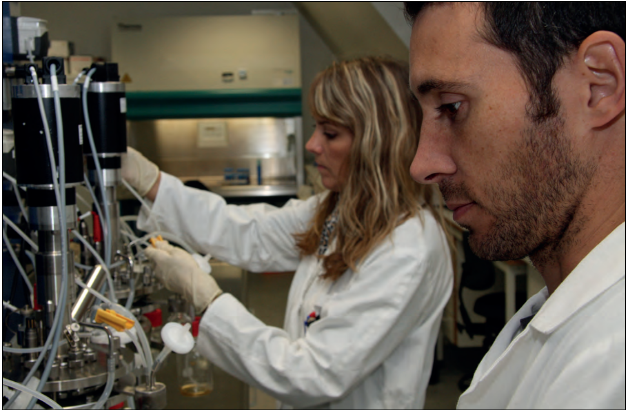
Figure 3.1 The Norwegian company Pharmaq has received funding under the EU's Eurostars Programme to develop new salmon vaccines, together with the Swedish company Isconova. The Eurostars Programme provides funding to research-performing small and medium-sized enterprises.