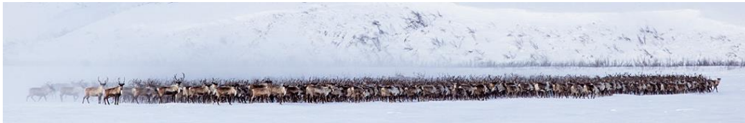
Pic: Canadian Reindeer Herd.

There has been good progress on outreach and knowledge development activities, and especially so regarding EALLU and Rievdan. GEF/ UNEP Nomadic Herders has also had good progress, the external conditions taken into account.