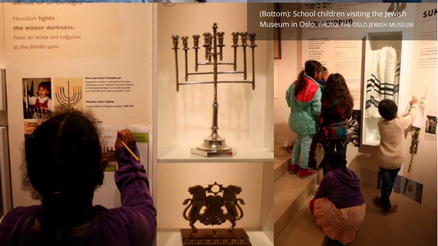
(Bottom): School children visiting the Jewish Museum in Oslo.