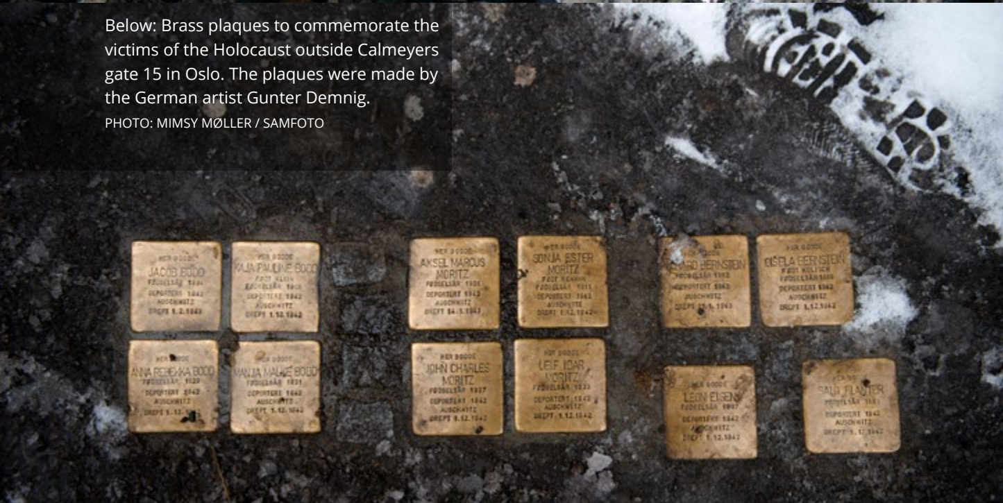
Below: Brass plaques to commemorate the victims of the Holocaust outside Calmeyers gate 15 in Oslo. The plaques were made by the German artist Gunter Demnig.