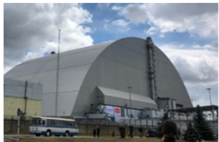
Chernobyl Shelter in 2019

The primary objectives and geographical scope for Norway's international work to promote nuclear safety and security remain unchanged. Norway will strengthen cooperation with Ukraine, and continue cooperation in other parts of Eastern Europe, the Black Sea region and Central Asia. However, in light of the changed security situation, we will need to develop new ways of working and consider entering into new partnerships.