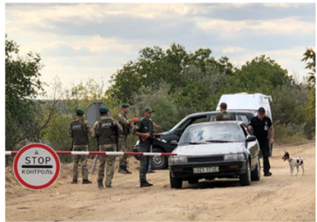
Exercise in the use of measuring equipment to detect smuggling of radioactive material in Ukraine, 2019.

The suspension of cooperation with Russia will inevitably reduce access to knowledge about nuclear safety and environmental impacts in the Arctic. Norway will continue to address unresolved challenges in this area. Priorities for future efforts include enhancing environmental monitoring and impact assessments of potential accidents and incidents involving sunken and dumped objects in the Kara Sea, nuclear-powered